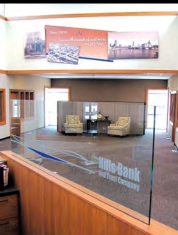
Custom wall art to fit into a space