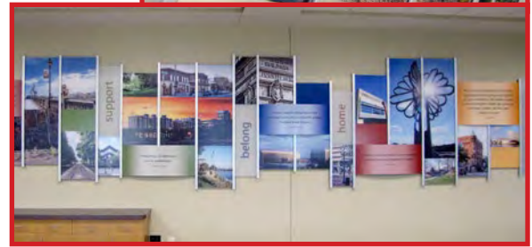
Dynamic wall displays combine photos and quotes that stand out