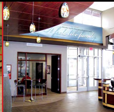
Transform wall space using custom wallpaper treatment.