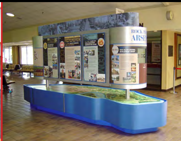
Branded kiosks represent identity and interact in multiple ways