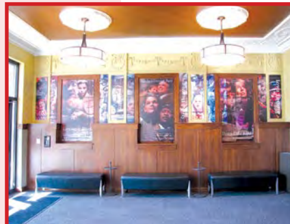
Promoting brand within wayfinding graphics