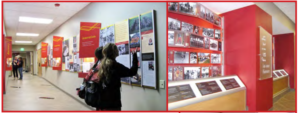
Contact points in a space designed around a brand